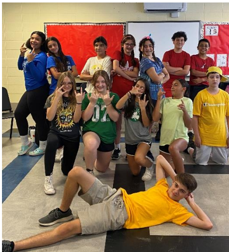
8 th Grade Bonding Day