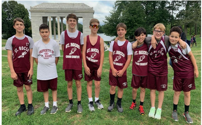
Cross Country – 1 st Meet