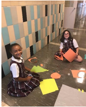
4 th Grade hard at work!