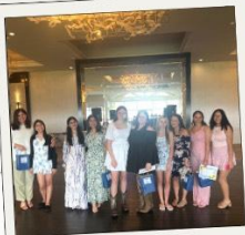
8 th Grade Mother & Daughter