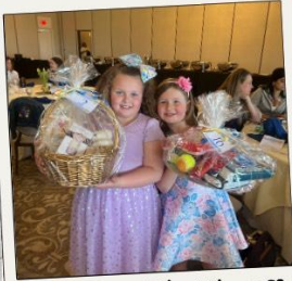
Basket Raffle Winners GALORE

Do small things with great love -Mother Teresa