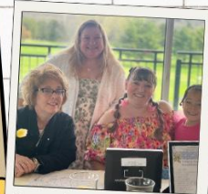
Our volunteers make it all happen