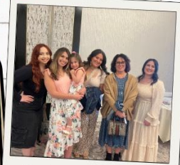
Thank you to everyone who came out to our Mother & Daughter Brunch

The Annual Mother & Daughter Brunch was held this past Sunday April 27 th at the Kirkbrae Country Club. It was a beautiful event celebrating Mothers & Daughters, Grandmothers, Aunts; all the Special women in our SRS girls lives! The 8 th grade girls made a special tribute to their moms and we danced the afternoon away! Thank you for all who attended, helped out and donated to this event! These events could not happen without your support!