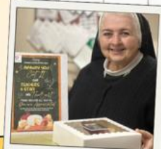
Our Staff is a Cut Above the Rest