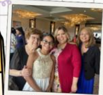
Thank you to everyone who came out to our Mother & Daughter Brunch