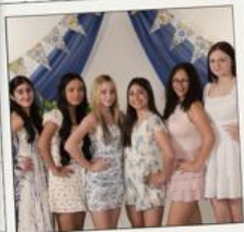
Mother & Daughter Brunch

Do small things with great love -Mother Teresa