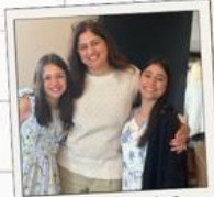
Happy Mother's Day

It's On! Your dedicated team of Parent Association members have made sure we have a Father & Son Event this year! Join us Sunday May 25 th 1:00-3:00pm (See attached flyer.) Please sign up by May 19 th . If you would like to help out at this event. Contact: aanderson@stroccoschool.org /text 508-801-4275